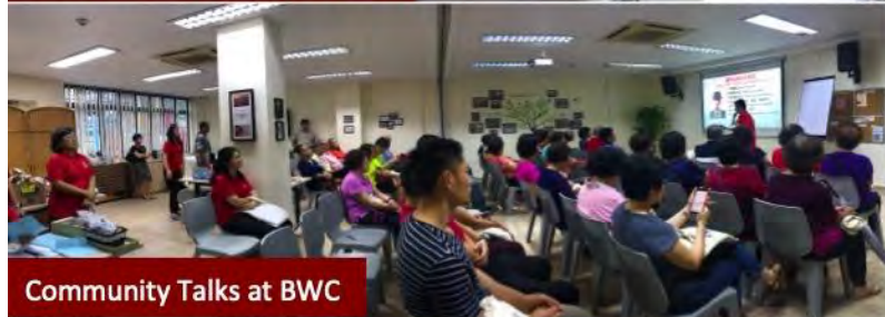
Community Talks at BWC