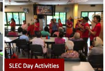
SLEC Day Activities