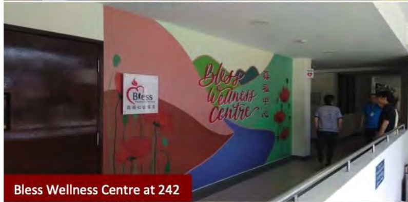
Bless Wellness Centre at 242