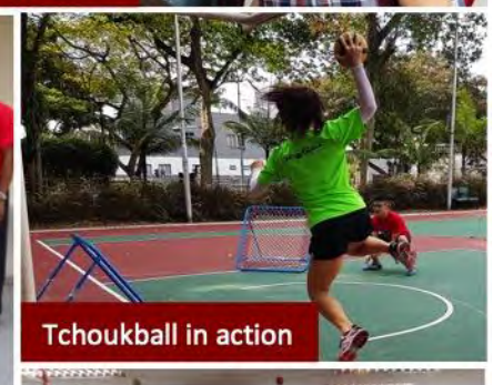
Tchoukball in action