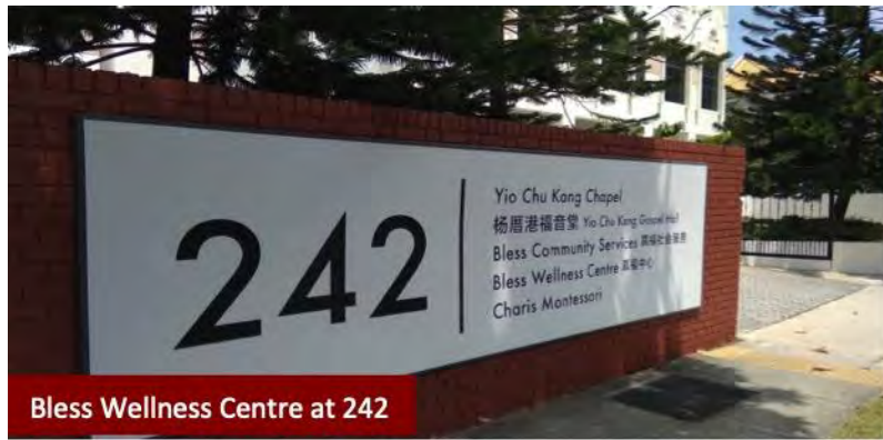
Bless Wellness Centre at 242