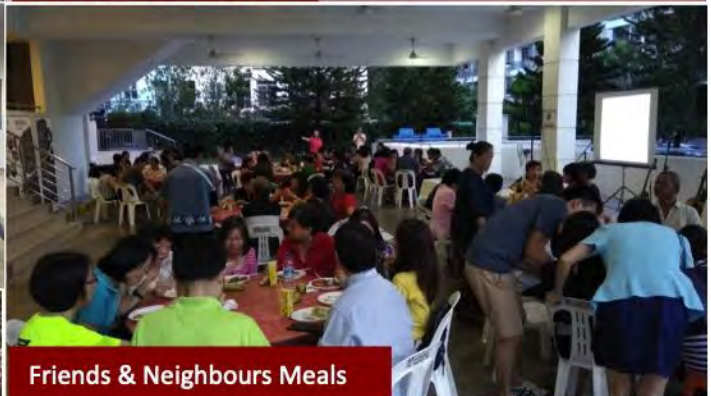
Friends & Neighbours Meals