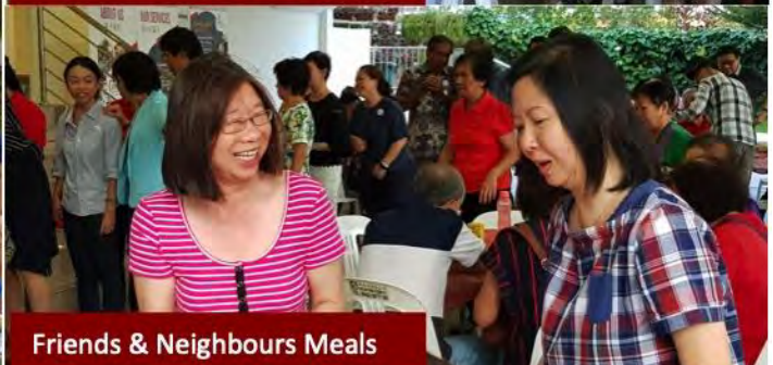
Friends & Neighbours Meals